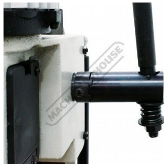
Handle Repositioning via Drive Dog System