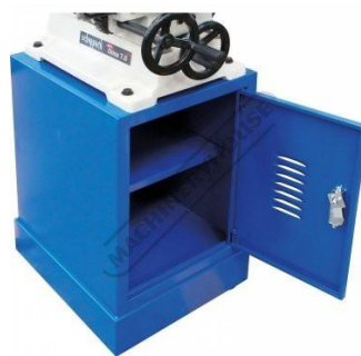
Cabinet Stand with Key Lock