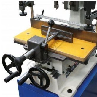
Adjustable Table with Vice Clamps