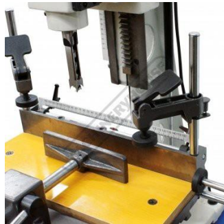
Overhead Material Clamps