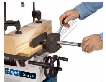
Cam Lever Vice Clamping