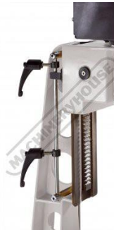
Dovetail Vertical Head Slide