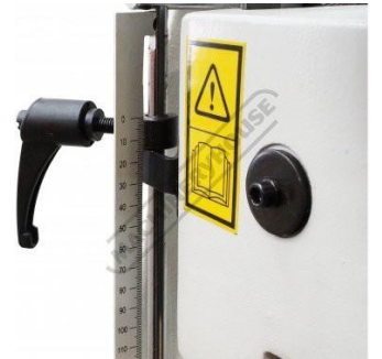
Mortise Head Depth Stop Gauge