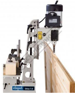
Head Reversed for Door Locks