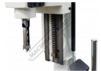
Rack and Pinion Head Movement