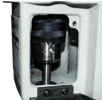
Keyed Chuck for Drill Bit