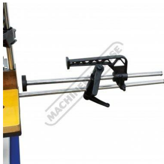
Adjustable Length Stop